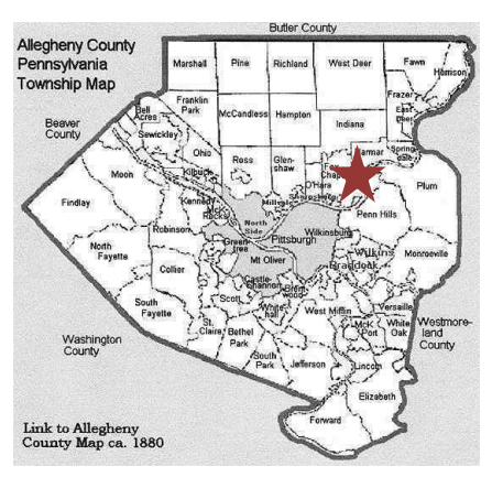
Figure 1: 123 Alpha Drive Location in RIDC Park and Allegheny County