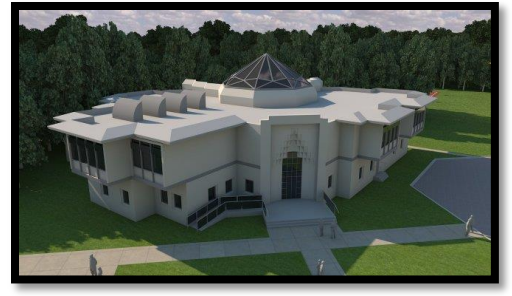
Figure 2: Cultural Center