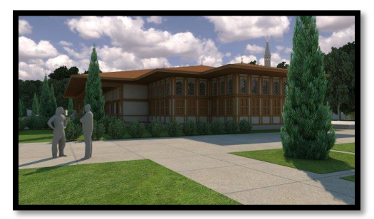
Figure 1: Fellowship Hall

The façade of the Fellowship Hall is comprised of Portland cement plaster on metal lath supported by cold formed metal steel. Ornamental wood trim is attached to the surface of the Portland cement across the entire façade. Convent/Monastery has a façade of anchored stone veneer on the first floor and Portland cement plaster on metal lath on the remaining floors, both supported by cold formed metal studs. In comparison, the façades of the other buildings are typically stone panels supported by channel and rail systems and CMU wall. Below, Figures 1 and 2 shows an example of the architectural differences between the Fellowship Hall and the Cultural Center.