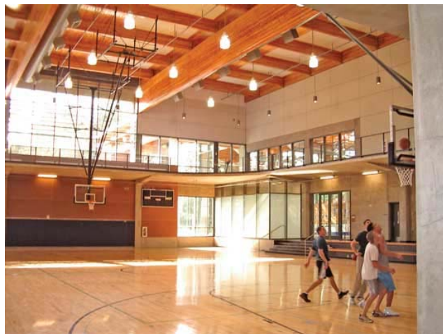
Figure 1-2: Gymnasium with glulam structural system.