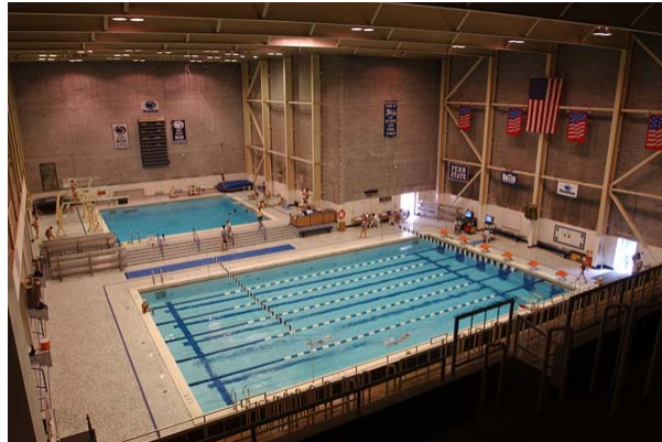
Figure1-1: Natatorium with steel structural system.