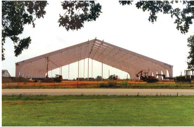
Figure 1-5: Glulam Arches

In the natatorium of the Pearland Recreation Center and Natatorium a glulam structural system is used, including 14 glulam arches. These glulam arches are connected to the concrete footers using bolts. The bolted connections of these arches were difficult due to the small tolerances of the glulam arches. In hind sight, the contractor suggested that a welded connection would have been more constructible.