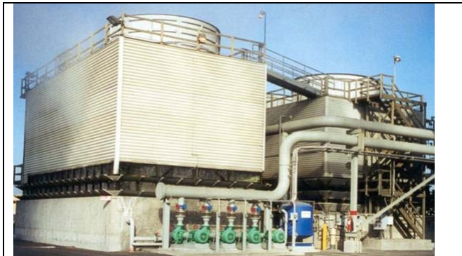
Figure 1-3: Cooling Tower