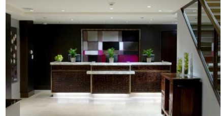
Figure 1.3: Front Desk