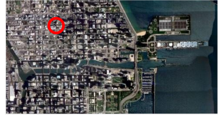
Figure 1.2: Location in Chicago