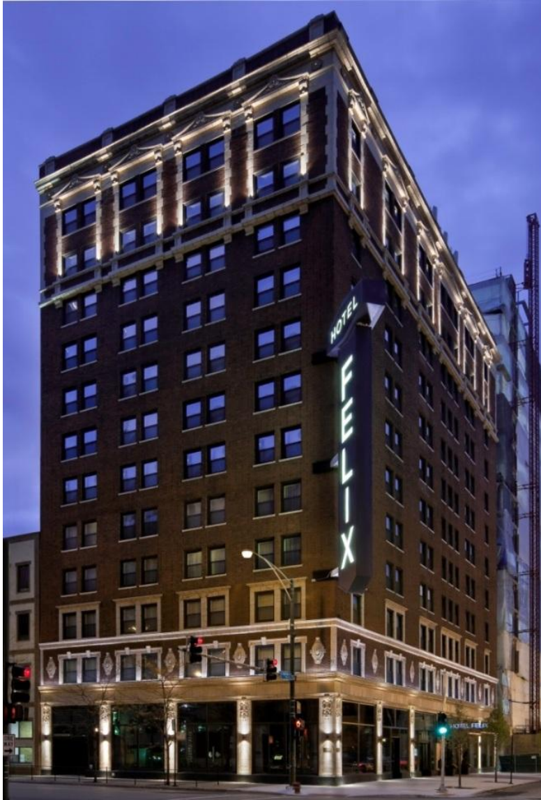
Figure 1.1: North and East Façade Elevation