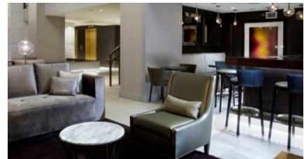
Figure 1.5: Lobby and Bar