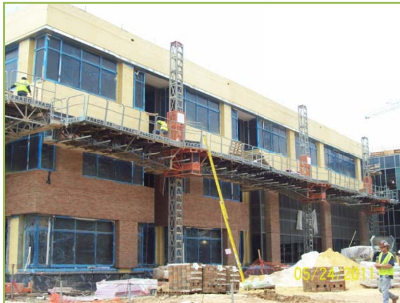
Figure #2 – Recessed Façade Features

The recessions in the current façade design demand extensive custom cutting of bricks for placement at the complex corners. This process elongates the time necessary for brick placement by reducing the ability to keep a constant brick placement pace across the entire façade.