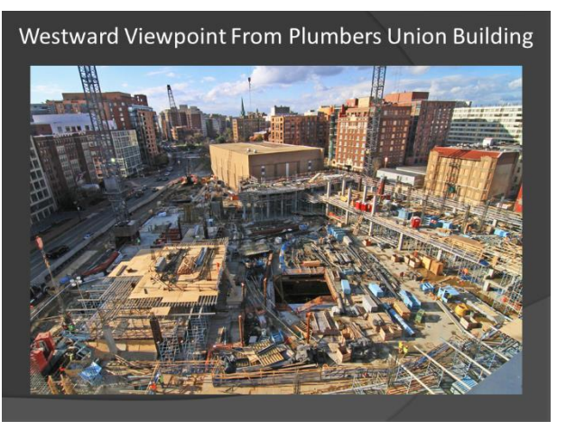
Figure 1: Image of Project Site

The existing building also created problems with the excavation process, leading to a much more extensive excavation. The benefits of completely destroying the existing building may lead to unforeseen benefits in the excavation process.