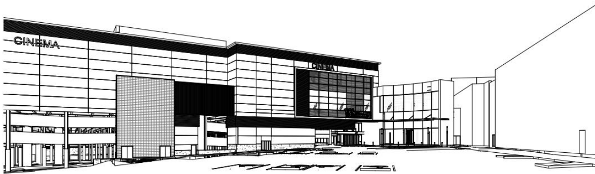
Image from Architectural Drawings