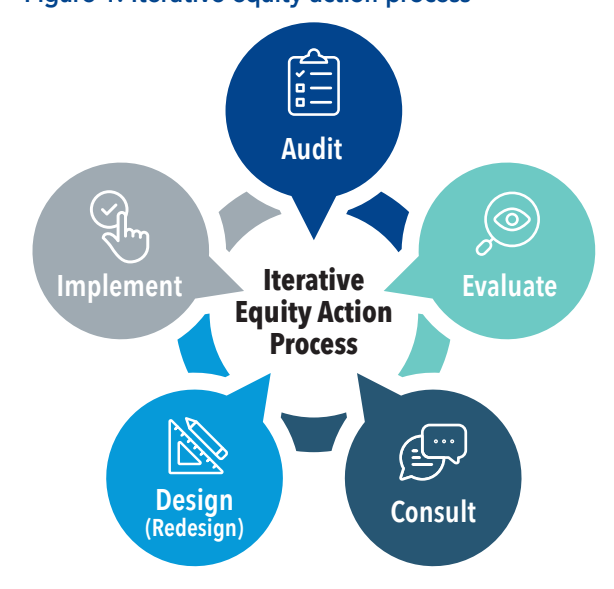
Figure 1: Iterative equity action process

The EAP has been initiated and will sustain an iterative process to audit, evaluate, consult evidence, design (or redesign), and implement interventions that foster a more equitable and inclusive engineering community. Newly designed or reimagined interventions and experiences for students, faculty, and staff communities will enable the college to expand best practices in advancing sustainable diversity and to demonstrate more equitable educational attainment and career advancement.