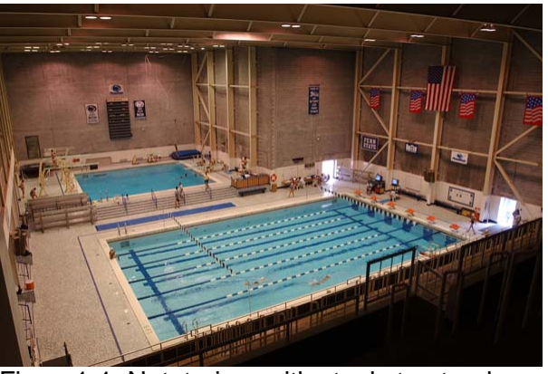
Figure1-1: Natatorium with steel structural system.

Determine the structural and economic feasibility of using a steel structural system in place of the currently designed glulam system in the natatorium, including identifying the durability of steel and glulam in a natatorium's humid environment.