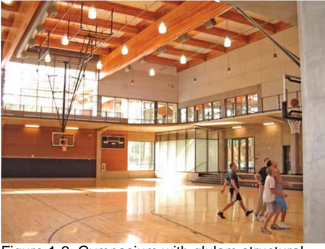
Figure 1-2: Gymnasium with glulam structural system.