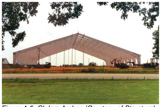
Figure 1-5: Glulam Arches

In the natatorium of the Pearland Recreation Center and Natatorium a glulam structural system is used, including 14 glulam arches. These glulam arches are connected to the concrete footers using bolts. The bolted connections of these arches were difficult due to the small tolerances of the glulam arches. In hind sight, the contractor suggested that a