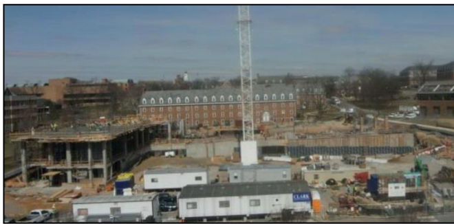
Figure 1: Current Superstructure

The super-structure of Prince Frederick Hall is currently cast-in-place concrete. This