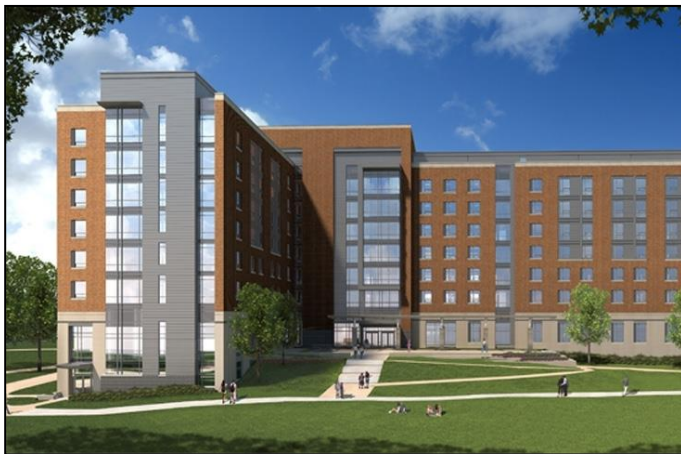
Figure 3: South Side of the Building

Another system to investigate that may help to achieve a Platinum certification is