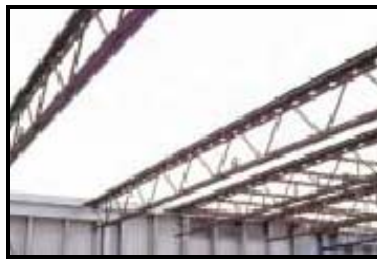
Figure 1 Typical Hambro Joist Layout

The structural system of the building is load-bearing light gauge metal stud walls and masonry shear walls. The structure also consists of tube steel columns, but they only extend up to the second floor. The floor system is a composite system of Hambro open web steel joists that bear on the load-bearing walls, see illustration in Figure 1. On the fifth floor, the light gauge metal studs convert to wood framed walls. This can be done because the building is of Construction Type R-2 as per BOCA 1999 building code, Section 310.4.1 (Dormitories) and Table 602 (Fire resistance Ratings of Structural Elements). This means that as long as the wood members are fire retardant, they can be used in the building. The roof consists of pre-fabricated wood trusses that are of multiple sizes and shapes to fit the architectural situations. The foundation system consists of strip footings and retaining walls, which adequately transfer the load from the building to the earth below. See building section attached on page 9, for a section view of the structural system.