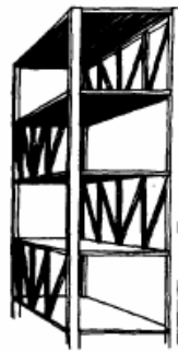
Figure 3 Typical View of a Steel Frame System

Alternative #2 will be a steel frame system is made up of structural steel elements, as illustrated in Figure 3. The floor system will be a composite beam system where the metal deck and the beam are joined together by shear studs. The slab will be 4” thick with a ribbed metal deck designed by United Steel Deck design manual. The live loads on the floor system will be determined as per 1999 BOCA building code with a 40 psf in the apartments and 100 psf in the corridors. All of the composite beams and columns will be designed using the Manual of Steel Construction (Load & Resistance Factor Design) Second Edition.