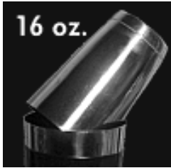
A. Shaker set

Ice – Frozen water, often served in cube form.