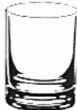
C. Rocks Glass