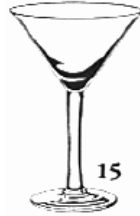
B. Cocktail Glass