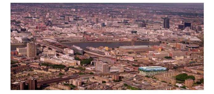
Figure 6.1 The Palestra Building super-imposed onto its lot.

there is an unobstructed southern exposure from the roof level, allowing maximum solar gains, as shown in the image to the right. However, the placement of the solar PV cells is crucial to the success of such a system. And unfortunately due to the