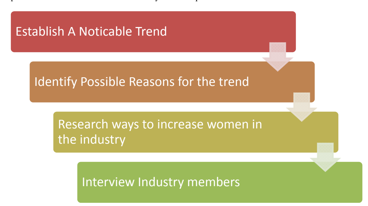
Figure 1.a. Research Process

Opinions from individuals within the industry will be required.