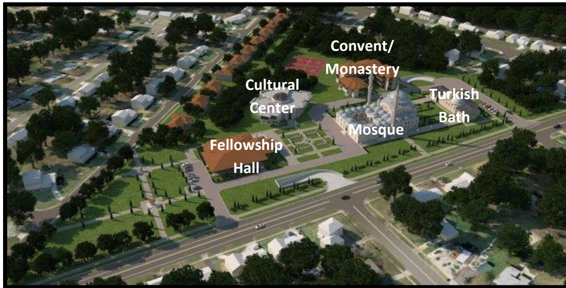
Figure 1. Overall Site

This Campus Project, located in the northeastern US, is a multi-building, multi-use project, built to serve as a community and cultural gathering place. It consists of five unique buildings, an underground parking garage, and a geothermal well field. The five buildings are the Turkish Bath, Convent/Monastery, Mosque, Cultural Center, and Fellowship Hall, as labeled in the image below.