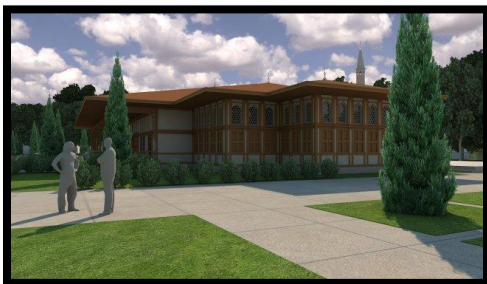
Figure 1: Fellowship Hall

The façade of the Fellowship Hall is comprised of Portland cement plaster on metal lath supported by cold formed metal steel. Ornamental wood trim is attached to the surface of the Portland cement across the entire façade. Convent/Monastery has a façade of anchored stone veneer on the first floor and Portland cement plaster on metal lath on the remaining floors, both supported by cold formed metal studs. In comparison, the façades of the other buildings are typically stone panels supported by channel and rail systems and CMU wall. Below, Figures 1 and 2 shows an example of the architectural differences between the Fellowship Hall and the Cultural Center.