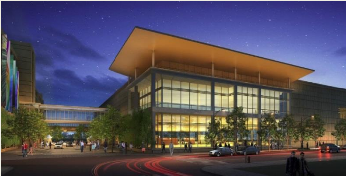
Casino Entrance at Night

Dates of Construction: June 2013-September 2014