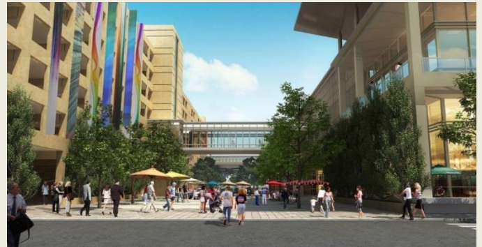
Active Outdoor Plaza